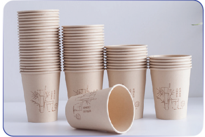
“Single Wall Cups”