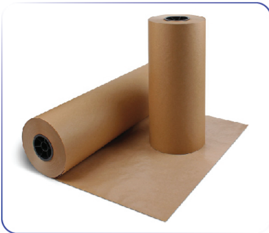
“Kraft Roll for bags”